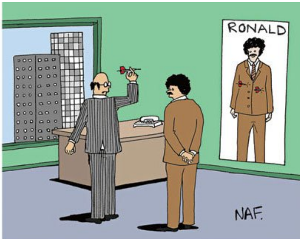
"Ronald, what gives you the impression I'm not happy with your work?"