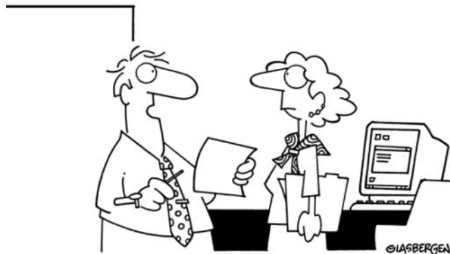
"Send him our toughest collection letter, threaten him with legal action, and subliminally suggest some type of bodily harm. But put XOXOXO under my signature to show that we still love him as a customer!"