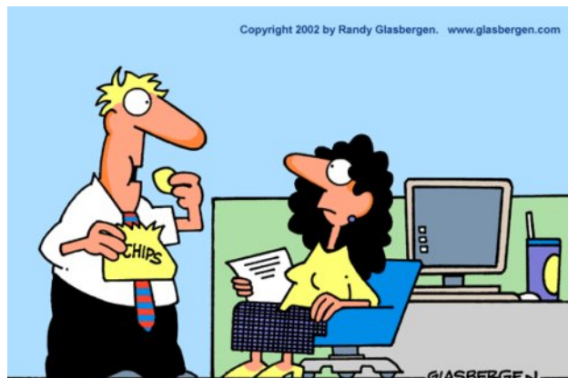
“They tried adding healthy snacks to the office vending machine, but all that rotting fruit made the candy bars taste bad.”

NOTICE THIS DEPARTMENT REQUIRES NO PHYSICAL FITNESS PROGRAM. EVERYONE GETS ENOUGH EXERCISE JUMPING TO CONCLUSIONS, FLYING OFF THE HANDLE, RUNNING DOWN THE BOSS, KNIFING FRIENDS IN THE BACK, DODGING RESPONSIBILITY, AND PUSHING THEIR LUCK.